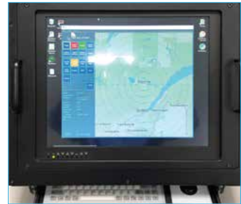
Upgraded PPI Display

Legacy displays are replaced with our new touchscreen LCDs to deliver significant usability enhancements, including software that provides superior tactical interfaces for operators. All tracked and untracked videos are output from the video processor as ASTERIX Ethernet signals in CAT-240. The additional capabilities added to the AN/TPS-43 signal and post-processing functions include ADS-B data incorporated and available at the output and on the display. Legacy maintenance display functions can optionally be integrated into and handled by the TSS PPI display. A 3D Tracker is an available option.